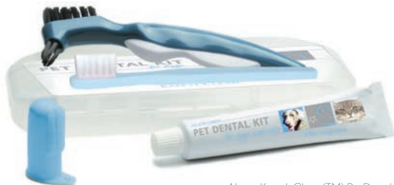
Above: Keep It Clean (TM) Pet Dental Kit; Below: Cloud Star's Minty Madness Buddy Biscuits