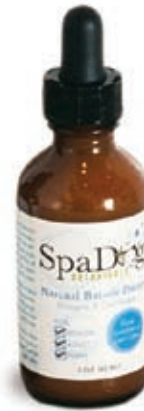
Natural Breath Drops from Spa Dog Botanicals