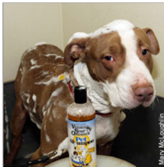
Clive Barker, an adoptable pooch at Little Shelter in Huntington, N.Y., gets an organic washdown.

January 27, 2008 -- LAST year's frightening pet-food recall taught owners the importance of reading ingredient panels on food packages to avoid potentially harmful gluten, and artificial preservatives and colors. But food isn't the only pet product animal lovers need to take care with.